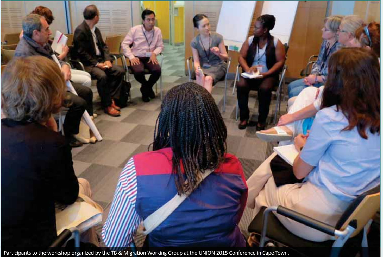
Participants to the workshop organized by the TB & Migration Working Group at the UNION 2015 Conference in Cape Town.

available for unregistered migrants), and a total of 4,683 migrants have been screened for TB and MDR-TB. From 2012 to 2015, 439 migrants were diagnosed with TB or MDR-TB in Rayong; two migrants with MDR-TB are currently on treatment.